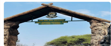
Lake Manyara National Park