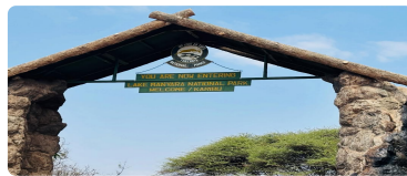
Lake Manyara National Park