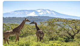
Arusha National Park