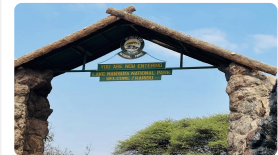
Lake Manyara National Park