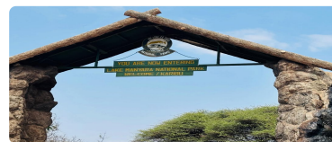
Lake Manyara National Park