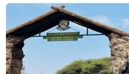
Lake Manyara National Park