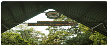
Kilimanjaro National Park