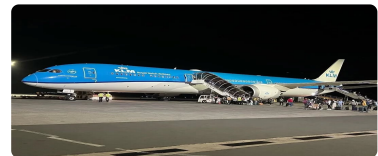
Kilimanjaro International Airport JRO