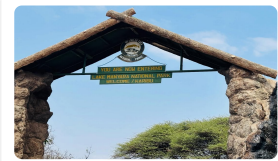
Lake Manyara National Park