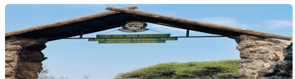
Lake Manyara National Park