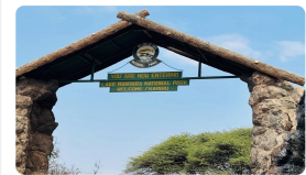
Lake Manyara National Park