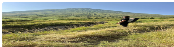
Ol Doinyo Lengai