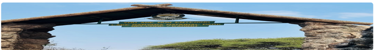
Lake Manyara National Park